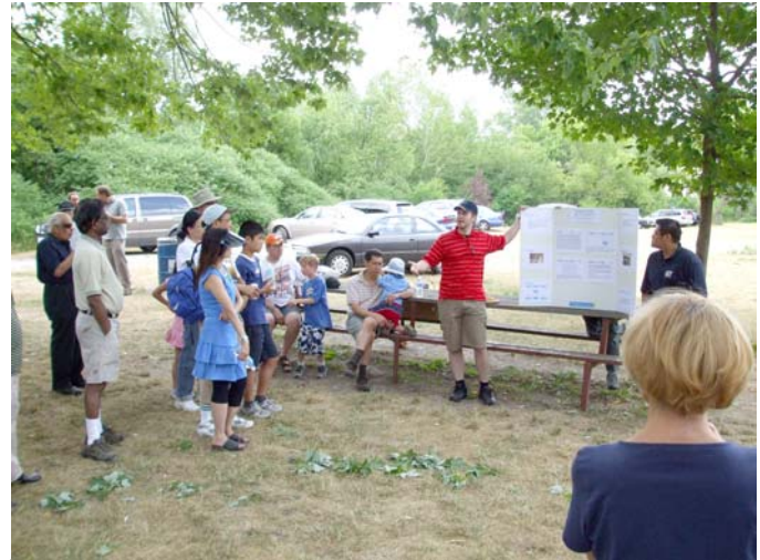
Figure 2 Ryerson students Poster session

building where the lecture was delivered, one of the slenderest residential structures in the world.