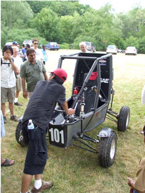
Figure 4 Guelph SAE racer

ICE presented a lecture by Agha Hassan of Halcrow-Yolles spoke specifically about the